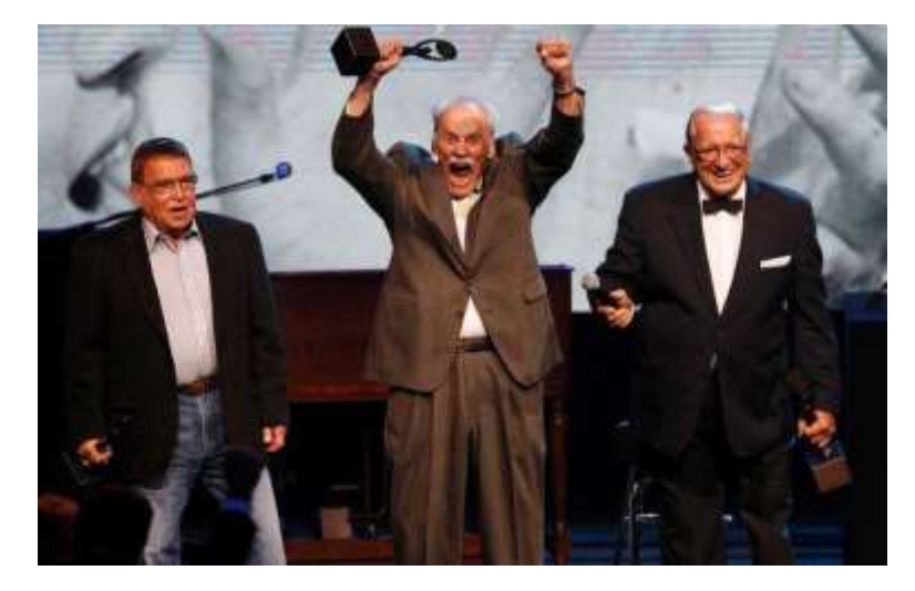
Rock & Roll Hall of Fame induction - April 14, 2012